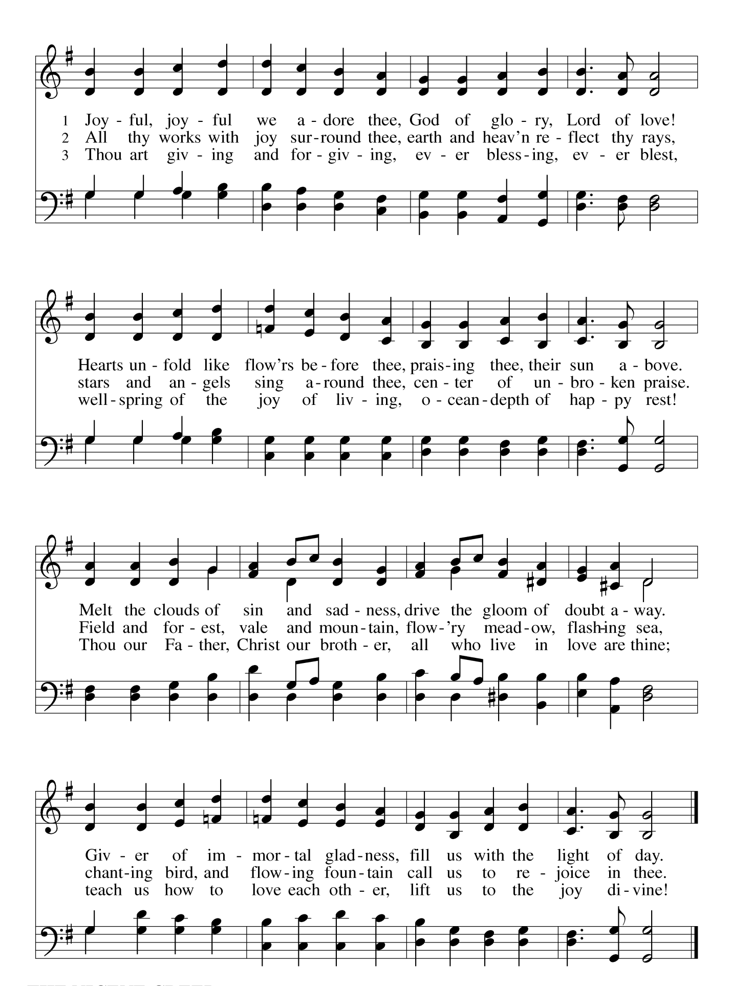
THE NICENE CREED